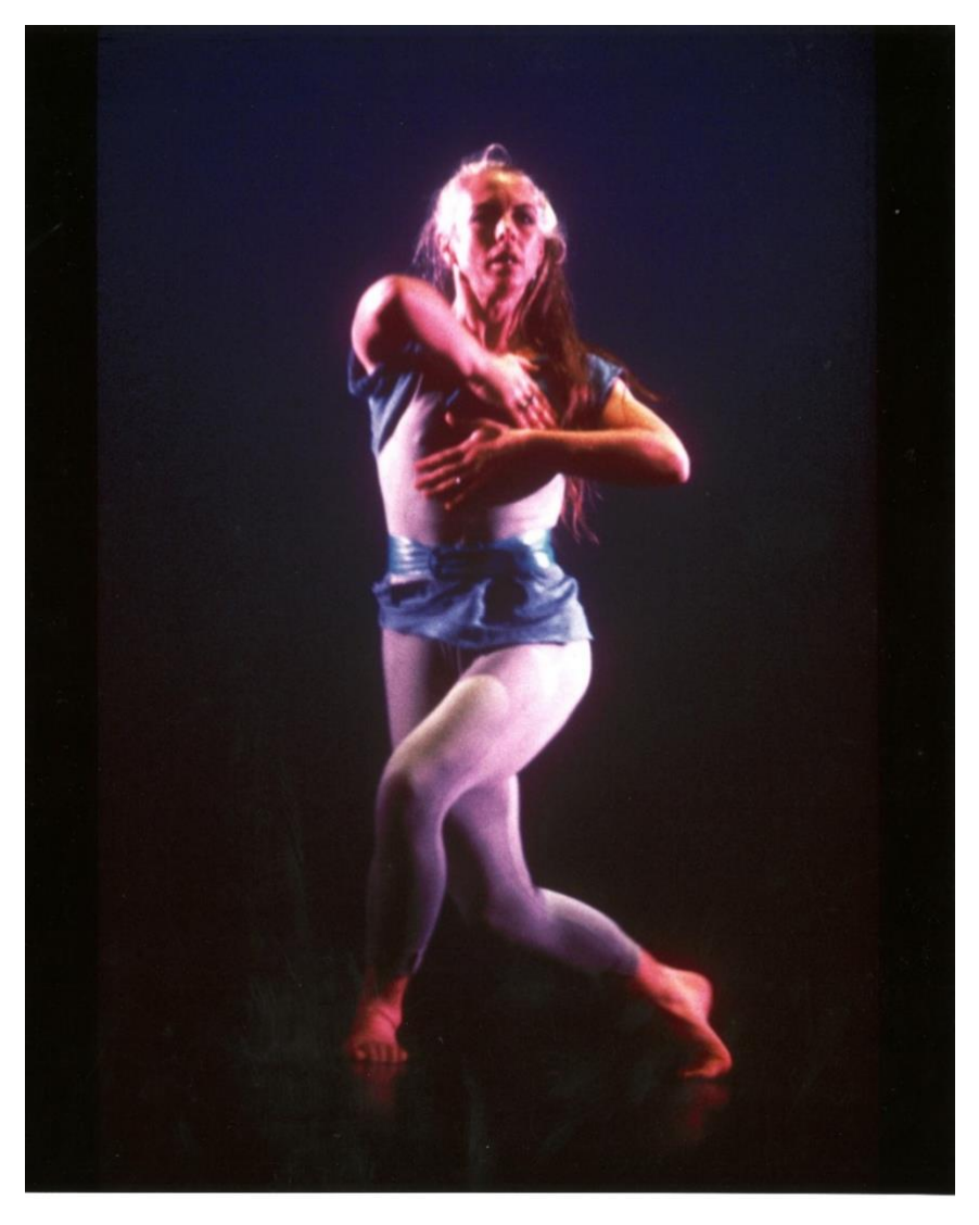
Figure 1: The author in Touch broken Antipodes , Maidment Theatre, Auckland 1987.

for more conscious eco-somatic sensory investigations of place. Meanwhile, in Auckland, I taught classes for all ages at the Limbs Dance studio and in urban schools and halls, including classes for the deaf and blind. The huge weekly African inspired community dance and music classes that I led confirmed my commitment to the benefits of dance as a social catalyst and, during the 1981 Springbok tour, they prepared us for the weekly 'Artists against Apartheid' marches.