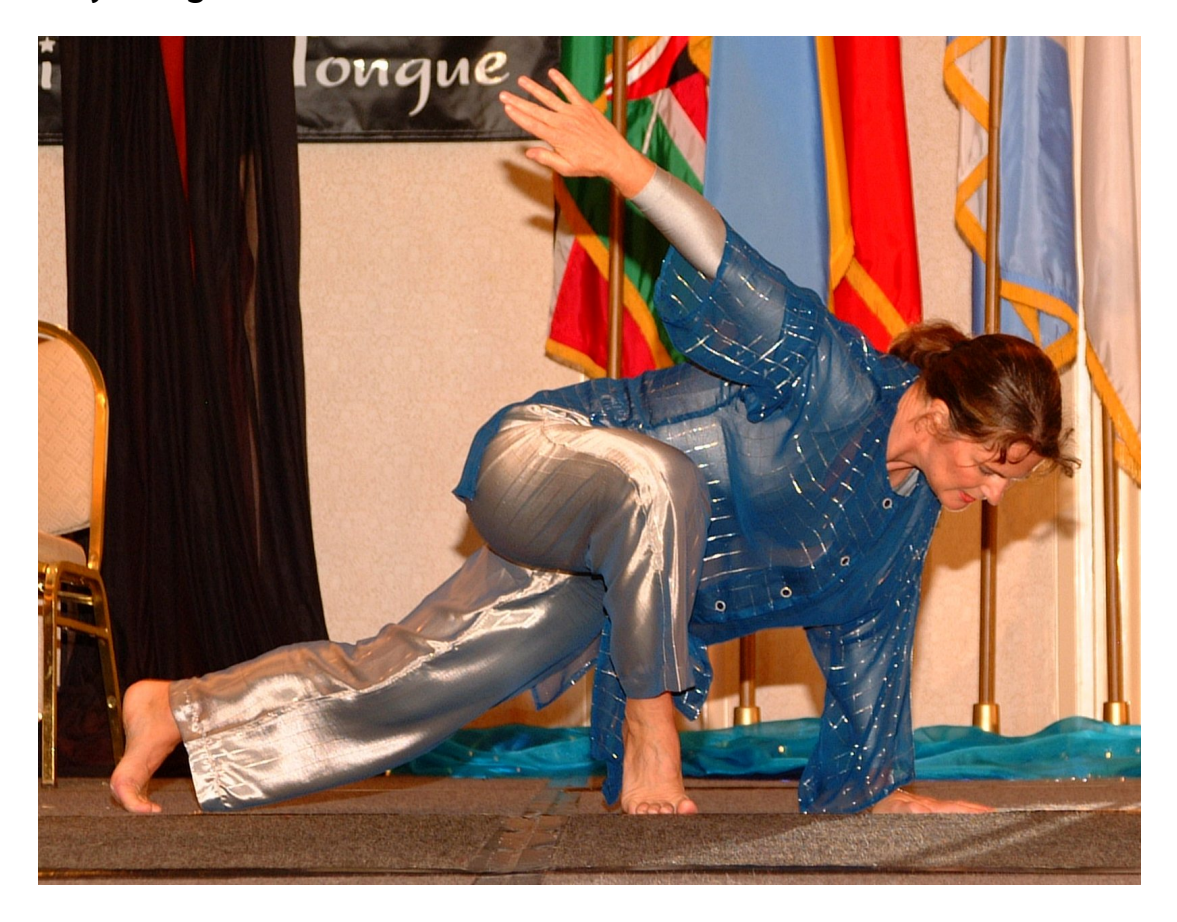
Photograph 1: Preferring: Debbie Bright

The first feature of the lived experience of a creative individual is that she/he often has a preference for a particular genre, style or area of expertise. Indeed, skills and preferences can be specific to a particular domain within a wider field. Thus, one Māori weaver may prefer to work with very fine threads and a particular range of colours, while another may prefer to use less traditional approaches to finish and neatness. One dancer may prefer to work within the genre of contemporary dance while another may prefer ballet or hip-hop. A creative individual may even have a preference within a particular style or genre. For instance, a dance-maker may prefer to work with live music, or without any music, using shapes and motion from nature or in the style of a particular historical genre. A dance-maker may also prefer to draw material from her/his immersion in spiritual, cultural or ecological worlds; she/he may wish to communicate these concerns in order to bring about political or attitude changes, enrich audience members, or influence atmosphere, mood or spiritual climate.