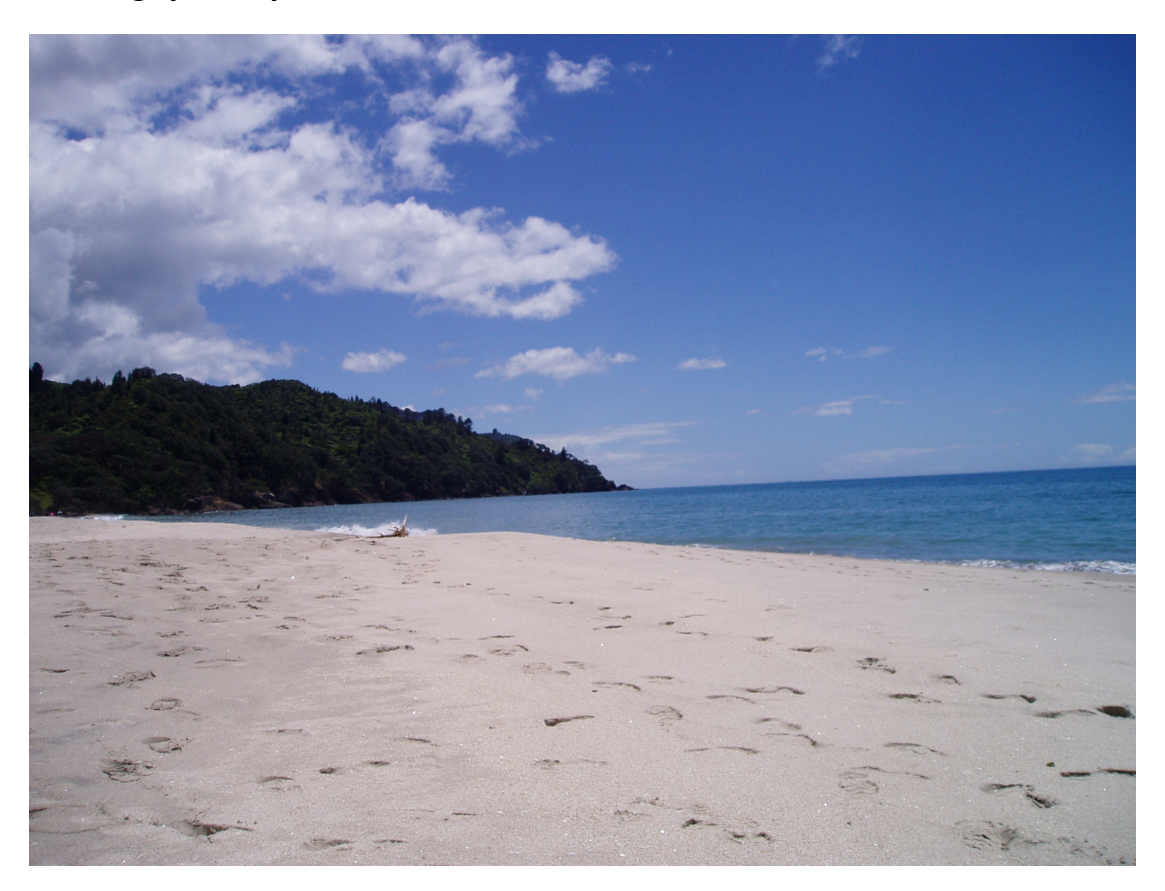
Photograph 5: Finding quiet spaces

The fifth aspect of creative process, finding quiet spaces, is mentioned by numerous writers. Many creative individuals are busy people with many responsibilities apart from their creative work. Thus, in my study, the other women and I negotiated times and places to meet for conversations, and managed postponements and interruptions within conversations and our many activities, responsibilities and commitments. We agreed that we all needed to be creative about how and when we could undertake our art-making (Bright, 2013b).