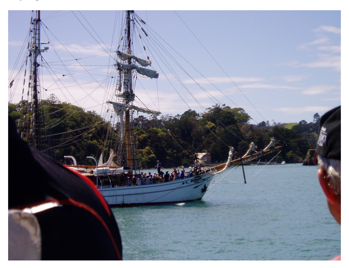
Photograph 6: Laying creative work aside

While the previous element appears to be unique to an FP-I approach to creative process, the aspect of laying creative work aside can be aligned somewhat with creative processes such as those of Balkin (1990) and Csikszentmihalyi (1996). Laying creative work aside could be similar to Balkin's incubation and 're' stages or Csikszentmihalyi's elaboration phase. For many artists, including dancers, the resting time appears to be a necessary pause in the flow of creativity. Tharp (2006) asserts that the creative person will make better progress if she/he allows space for refreshment and reflection in order that new revelation and creative solutions to problems may emerge. However, for some artists this act of laying creative work aside is also viewed as spiritual.